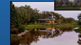
Chicago Botanic Garden Plant Conservation Science Center