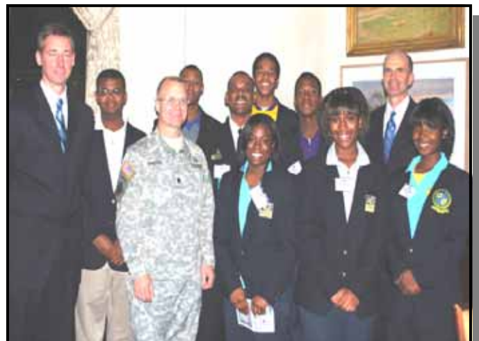
Students from ACE Tech Charter High School visited with presenters from the November CBC "ARRA" Membership Meeting after the event.

F inally, I must comment on CBC's Annual Golf Classic. Please mark your calendar for June 23, 2010, plan to attend, and support the event with your Sponsorships. We need everyone on deck...proceeds from the Golf Outing enable CBC's support of the ACE Tech High School program.