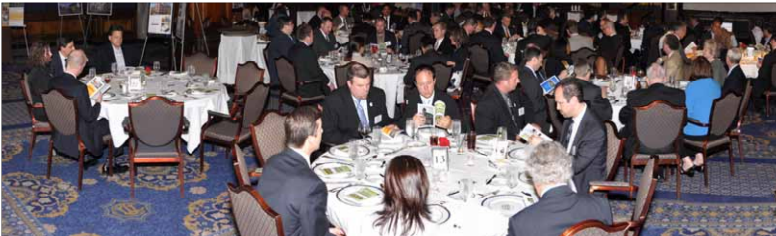
TWO HUNDRED AND THIRTY-EIGHT GUESTS ATTENDED THE MAY 20th MERIT AWARDS DINNER AT THE UNION LEAGUE CLUB.